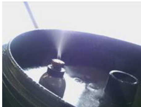
a fine mist produced by the washing heads

B.) The process of washing biodiesel involves mixing it with water.